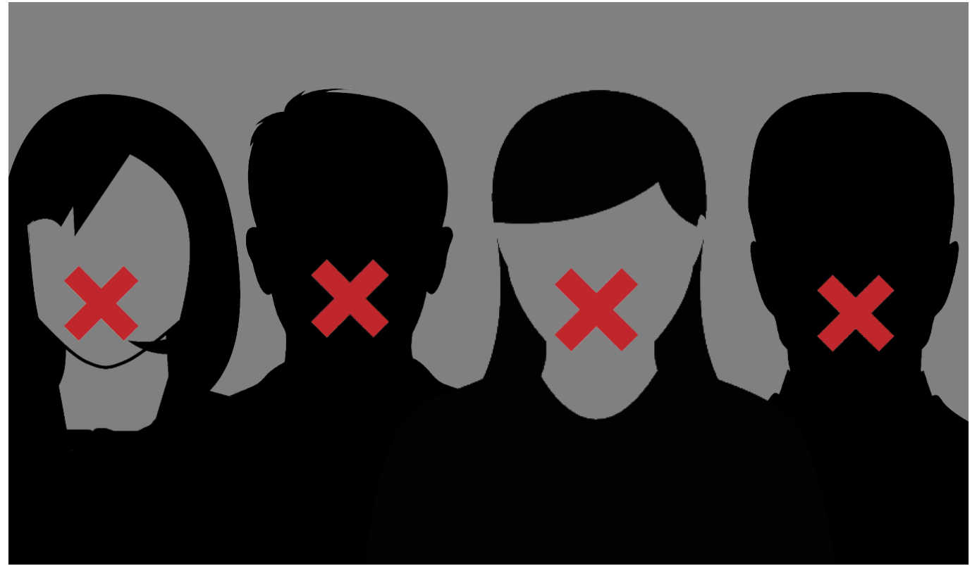
Academic freedom is about the right to study, teach and research a diversity of viewpoints. Yet, this right that is so crucial for the pursuit of knowledge has seen widespread attacks in colleges and universities across India.

The New Education Policy (NEP) 2020 claims it is based on principles that include creativity and critical thinking, constitutional values, a respect for diversity and the local context, a positive working environment for students and faculty, and substantial investment in a strong vibrant public education system. It also promises "merit-based appointment of leadership" in higher education institutions, and "freedom from political or external interference."